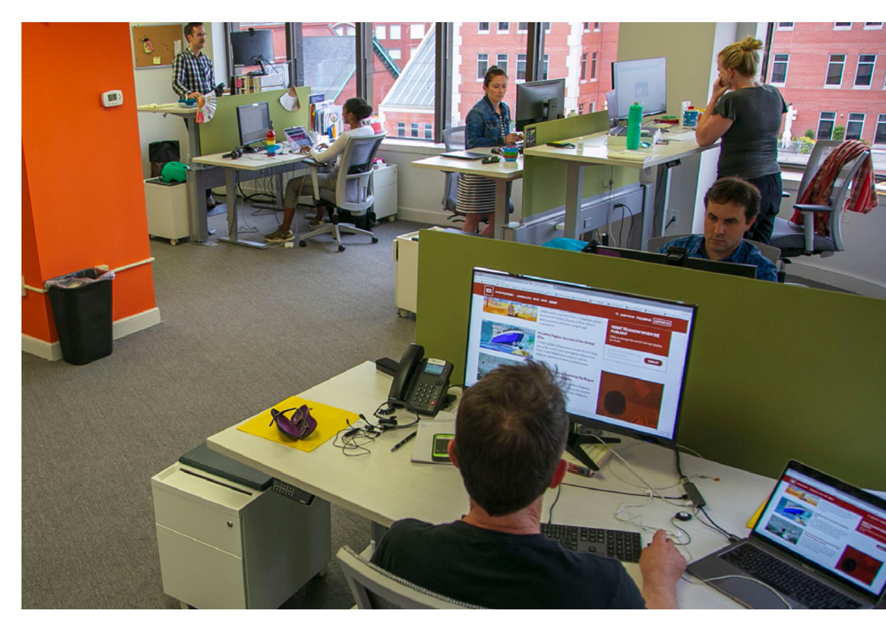
ICIJ's new office in Washington, D.C.

ICIJ's Washington, D.C.-based staff moved into a new office space to accommodate its growing team. Support for the new office was generously provided by the Hollywood Foreign Press Association.