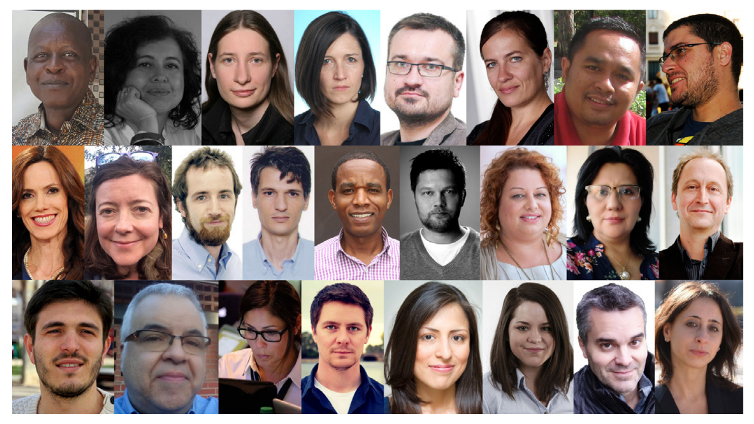
ICIJ added 25 new members to the network in 2017.